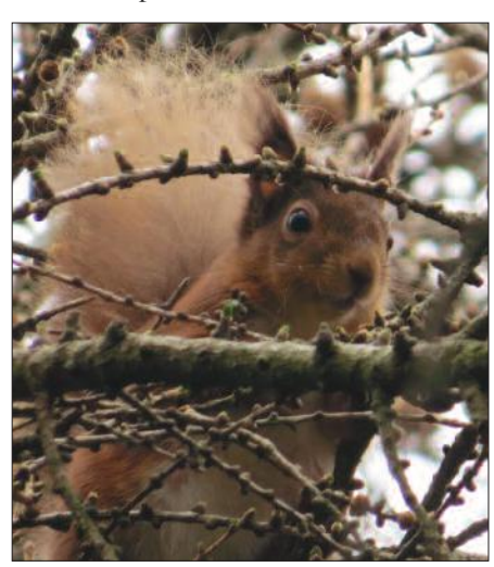
Red Squirrel feeding on Larch cones in Killiney Hill

for it and was happy to find the squirrels were still there when I returned. The 'scope is essential for watching and counting wading birds and birds at sea though I wouldn't normally bring it up to the wood but here we had a squirrel who wasn't going anywhere in a hurry and we were able to stand and watch one, highly magnified in the lens. The squirrel would stretch out to prise off a larch cone then, holding it in its front paws, it would furiously shred off the scales with its teeth to get at the seeds inside. We hadn't seen any reds for weeks and thought maybe they'd taken up residence in surrounding gardens as many did last year, so it was a delight to see two up here. The day that had begun with so little promise had brought great crested grebes courting, snipe in a new location and two very busy red squirrels.