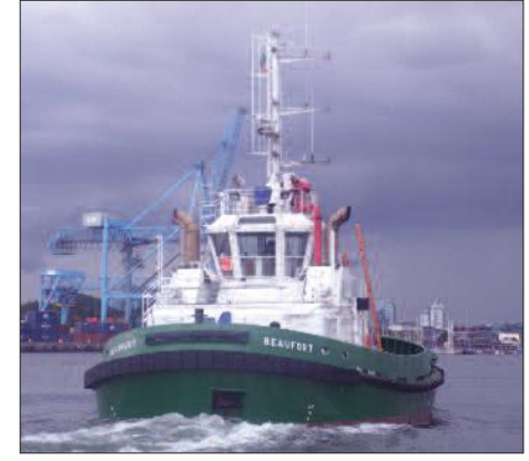
Dublin Port tug Beaufort, named after the Irishman who devised the wind-scale in 1805

In Sea Area Forecasts from Met Éireann, "Storm Force Warnings" are issued if Beaufort force 10 or frequent gusts of at least 61 knots are expected; "Violent Storm Force Warnings"