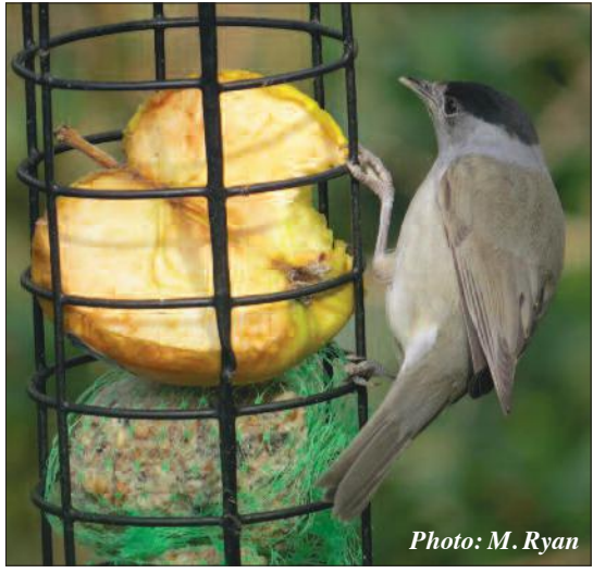
When all the berries have gone Blackcaps will eat apples. You don't have to put the apple slices in feeders, you can stick them on to branches or thread them with wire and hang them from a tree

bit of light. Thankfully as the first light did appear in the east the rain eased off but when we crossed over the railway line we saw the sea was well in already.