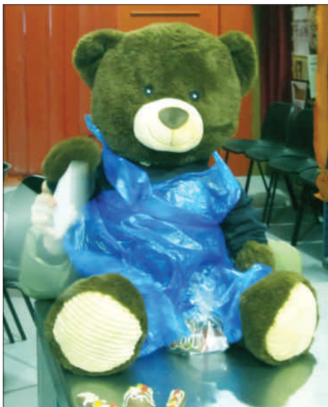
'Paddy' our new School Mascot