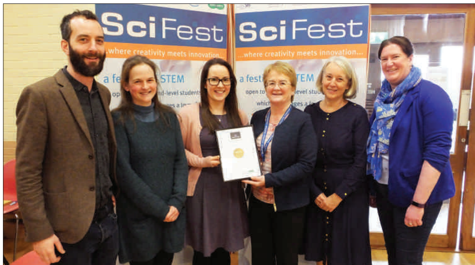
Rathdown Science Teachers