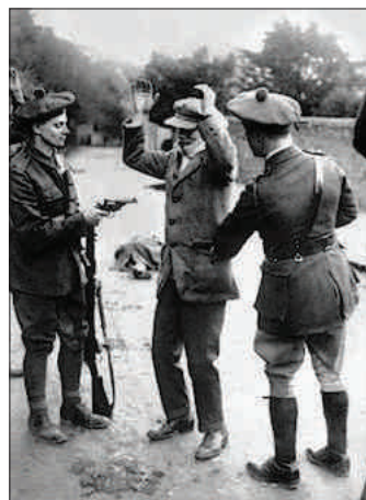
The Black and Tans on Vico Road

‘ An Cosantoir - March 2019 - Special War of Independence issue ’, Editor Sgt. Wayne Fitzgerald, published by the Irish Defence Forces. At only €3 this is an excellent publication which is an essential addition to any War of Independence collection of books and magazines - copies can be ordered through newsagents or via subs@military.ie .