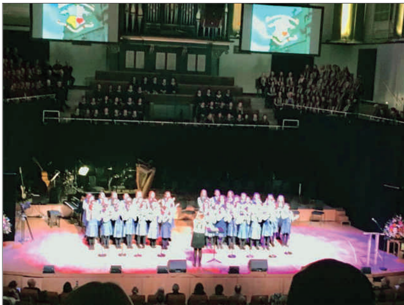
Celebrating 175th Anniversary of Loreto Abbey Dalkey in N.C.H.