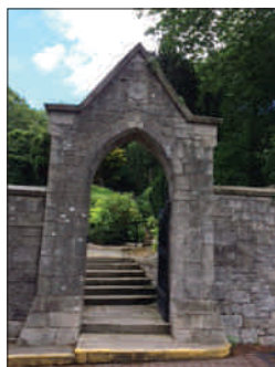
Holy Trinity Arch

Fête – Saturday 18 May 2019 Please support this event in any way you can.