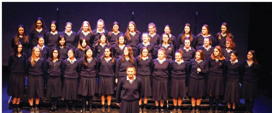
Rathdown girls singing at the Centenary Gala Concert