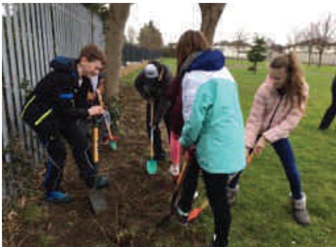
6th Class Pupils help plant hedge saplings