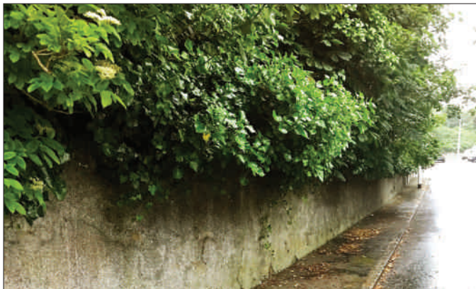
Untidy hedge

Dalkey is admired and loved by many. We are very fortunate to live and work in such a beautiful part of Ireland. Over the years, we have also won many awards in the National Tidy Towns Competition and in the DLRCC Tidy Districts Competition.