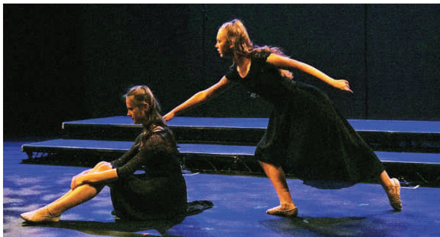
Rathdown School Centenary Gala Concert