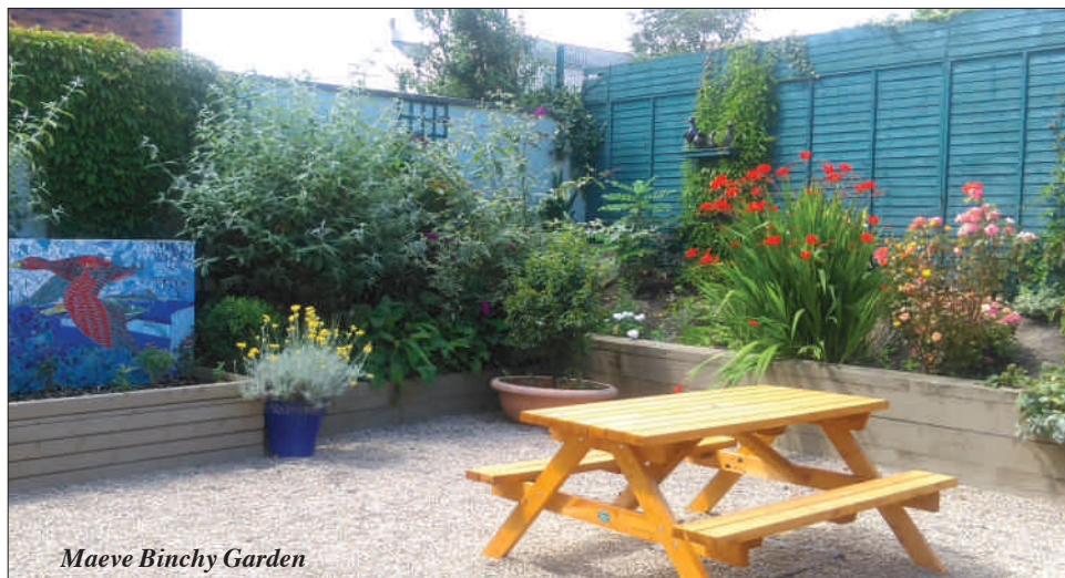
Maeve Binchy Garden