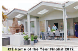
RTÉ Home of the Year Finalist 2019