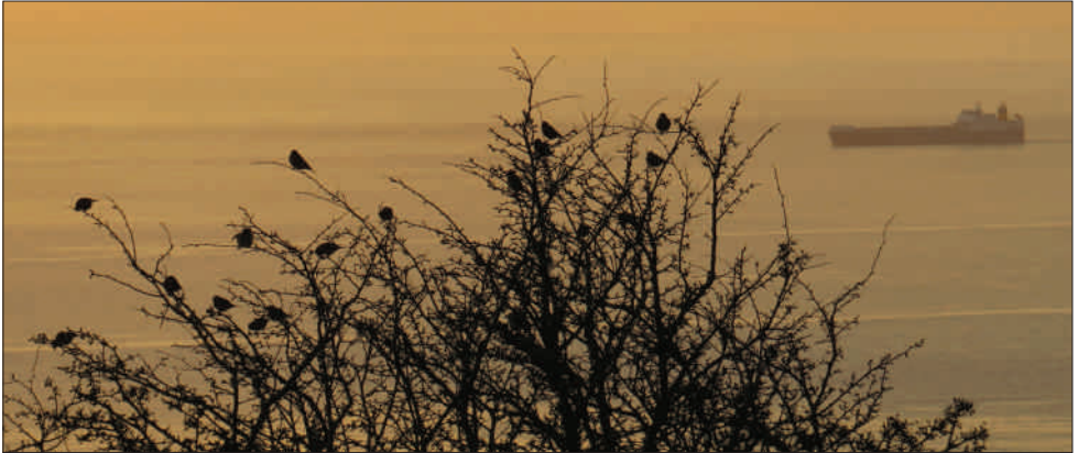
Flock of Linnets on a hawthorn at Killiney at dawn