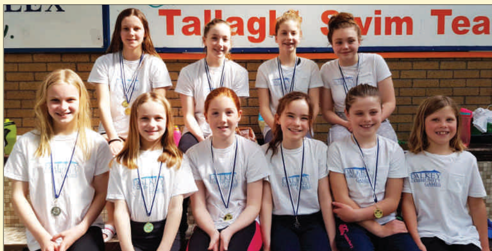
Dalkey Community Games - Girls Swimming Team