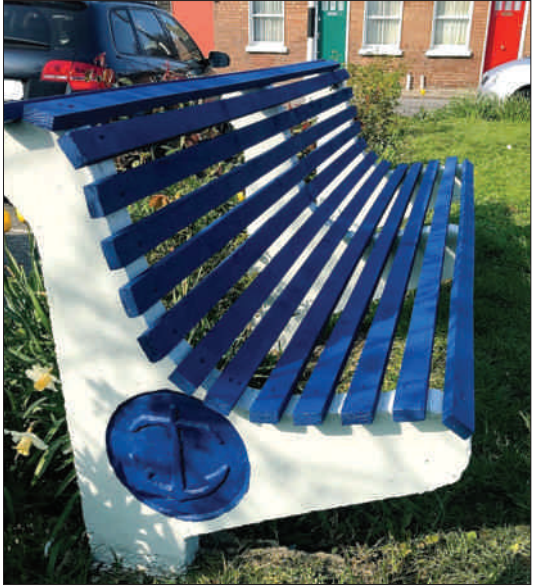
Historic Concrete Bench

including Queen Victoria. A total of 38 nations were involved. It's centre point was the fantastic glass structure of the Temple of Industry. This was 425ft long and 100 ft high. The