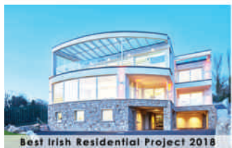
Best Irish Residential Project 2018

RESIDENTIAL | RETAIL | OFFICE | MEDICAL | HOSPITALITY | INDUSTRIAL | NEW HOUSES | EXTENSIONS AND RENOVATIONS