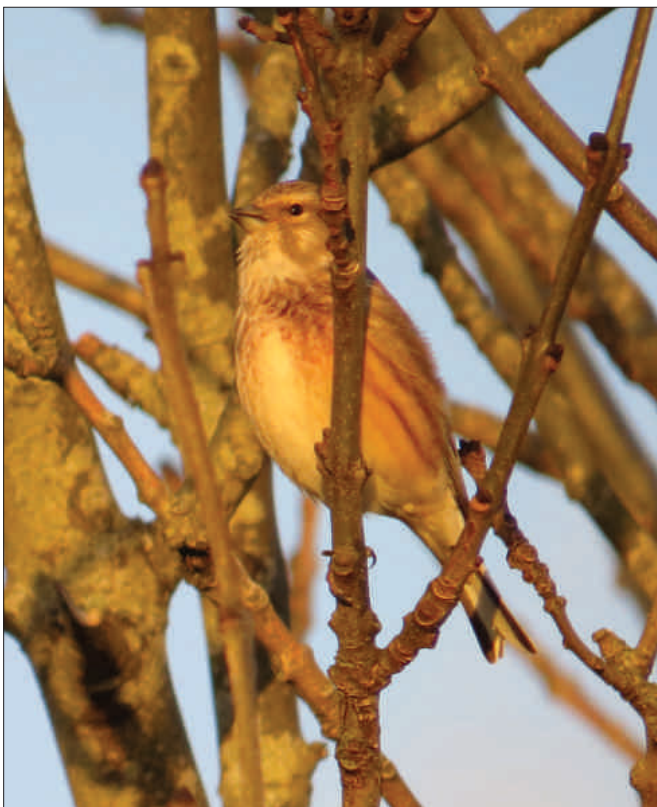
A Linnet on Dalkey Hill caught in the evening sun

A concerned local Dalkey resident and members of the Tidy Towns group have enlisted some expert help and advice to start a conservation project to help Swifts, those lovely high flying, sickle winged birds of summer who arrive in early May but have suffered in recent years by being deprived of traditional nest sites. If you know of swifts nesting in your house or in the vicinity it could be very helpful to the project and there'll be more news of the project next month.