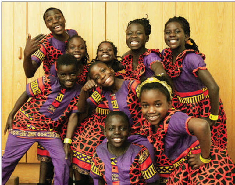
Abaana Choir Visit