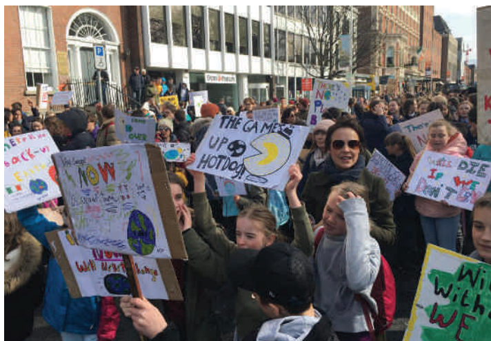
Students protest for climate change

climate change and pupils made posters pointing out the issues and demanding change. On Friday, March 15th , many of the pupils with their parents marched to Leinster House, joining thousands of other pupils from schools across the country, calling for the government to increase its action on climate change and stop destroying their future.