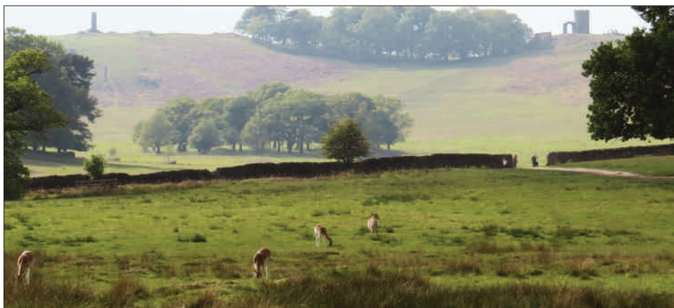
Bradgate Park with some of its 800 deer herd

Extending our break after attending a wedding in Leicestershire in the Midlands of England we got to see some of the local area. Leicestershire itself has idyllic picturesque farmland with softly rolling hills and dales, neat cereal fields, old solitary oaks and hedgerows overflowing with Hawthorn and Elder flowers. With lots of well-established woods comprising mostly native broadleaved trees in the county there are also some sizeable estates and parks one of which, Bradgate Park, is a former deer park of 830 acres with a current herd of around 550 animals, mostly Fallow but also some Red deer. There was in abundance all around the park many Yellowhammers. In Ireland these lovely bright yellow birds are usually found around cereal fields, usually in the east of the country and more common in the horticultural areas north of county Dublin and parts of Wicklow and