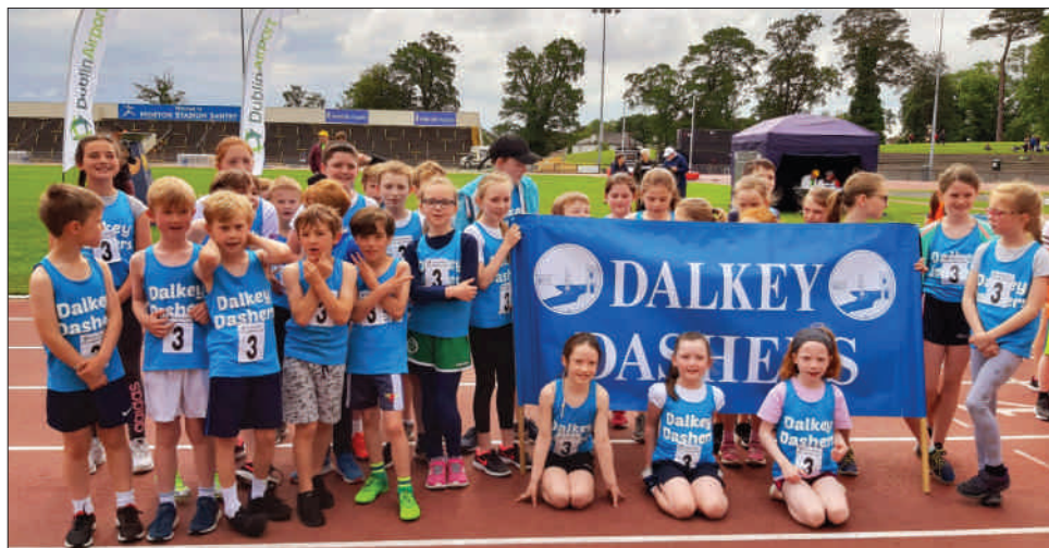
Dalkey Dashers at Santry

The weekend of June 8th and 9th June saw the grand finale of the season for the Dalkey Dashers with the finals of the Dublin Community Games in the Morton stadium in Santry. With the early departure of the two coaches from Harbour Road in Dalkey over 70 excited children and coach and parents headed off to Santry for a day of thrills and spills.