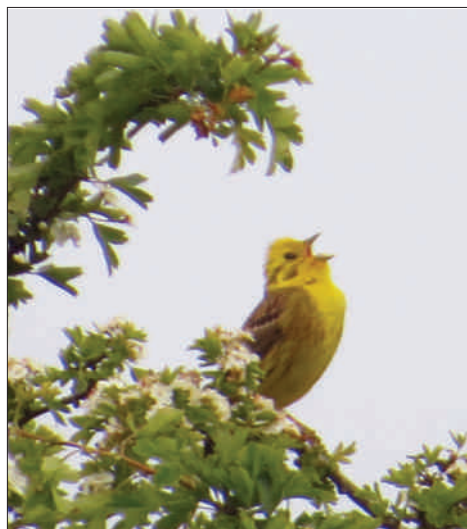
Yellowhammer singing from Hawthorn in Bradgate Park

Extending our break after attending a wedding in Leicestershire in the Midlands of England we got to see some of the local area. Leicestershire itself has idyllic picturesque farmland with softly rolling hills and dales, neat cereal fields, old solitary oaks and hedgerows overflowing with Hawthorn and Elder flowers. With lots of well-established woods comprising mostly native broadleaved trees in the county there are also some sizeable estates and parks one of which, Bradgate Park, is a former deer park of 830 acres with a current herd of around 550 animals, mostly Fallow but also some Red deer. There was in abundance all around the park many Yellowhammers. In Ireland these lovely bright yellow birds are usually found around cereal fields, usually in the east of the country and more common in the horticultural areas north of county Dublin and parts of Wicklow and