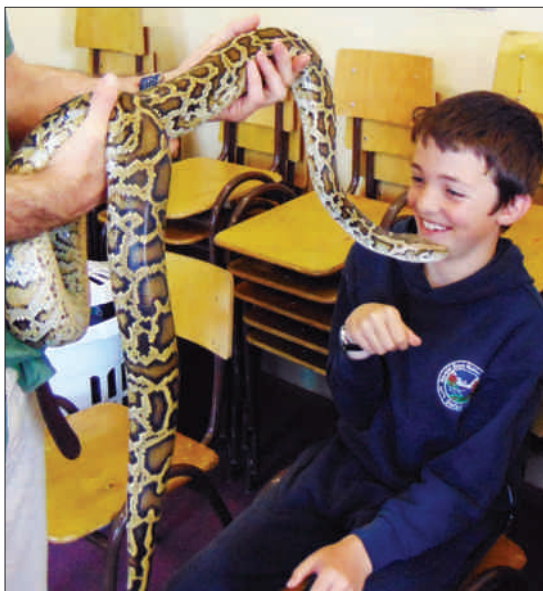
Sharon the python visits Harold Boys