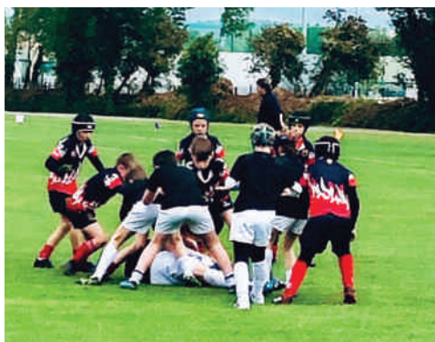
The Rugby Champions in action