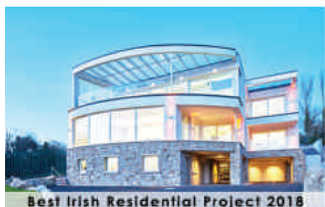
Best Irish Residential Project 2018

RESIDENTIAL | RETAIL | OFFICE | MEDICAL | HOSPITALITY | INDUSTRIAL | NEW HOUSES | EXTENSIONS AND RENOVATIONS