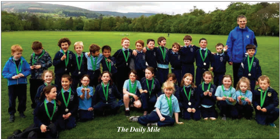
The Daily Mile