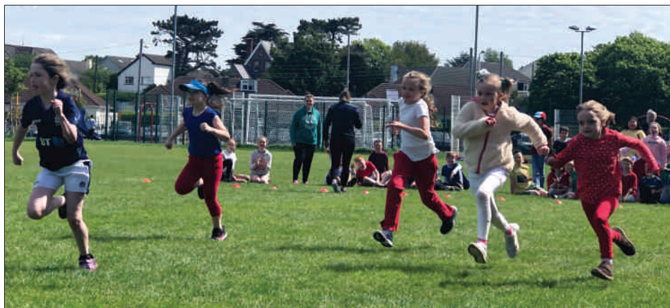
First Class Race