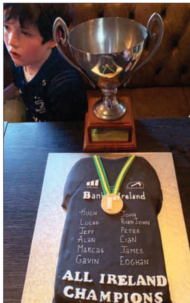
The Rugby Cup and Cake