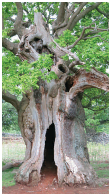
Ancient hollow Oak at Bradgate Park

literally shells, totally hollow on the inside. You could comfortably fit three or four people inside the trunk of some of them but since the tree's growth comes through the bark not the wood they still survive, grow and bear leaves. We stayed a few nights in the charming town of Oakham in Rutland. Rutland, adjoining Leicestershire, is the smallest county in the UK but it holds the largest man-made lake in the country at Rutland Water. Large areas of the county were flooded in 1976 to provide a fresh water reservoir to supply the East Midlands, submerging farmland and villages but now the lake has developed into a valuable wildlife habitat with two visitor centres, acres of reed beds and many managed habitats on its shores. Rutland Water is internationally important for the number of birds that winter there but it's best known as the place where Ospreys, fish eating eagles, were reintroduced into England in 1996 with chicks brought from breeding populations in Scotland. There's always a possibility that Ospreys might be bred in Ireland. In the past they've spent days feeding at Broun Lough in County Wicklow and many of our lakes and waterways would be ideal for these spectacular creatures.