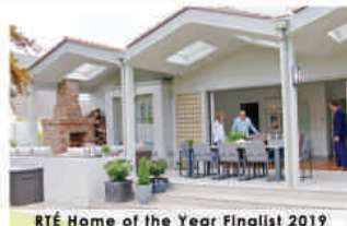
RTÉ Home of the Year Finalist 2019