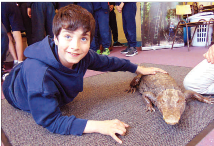
Kevin the Dwarf American Alligator